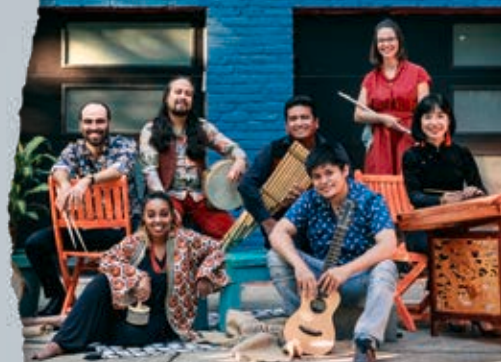
Maryland Band Directors Band