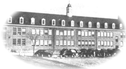
Montgomery College 1946 • 2006

On September 16, 1946, Montgomery Junior College opened at Bethesda-Chevy Chase High School with evening and weekend classes for 186 men and women.